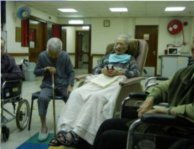
Terminally ill residents attending religious activities