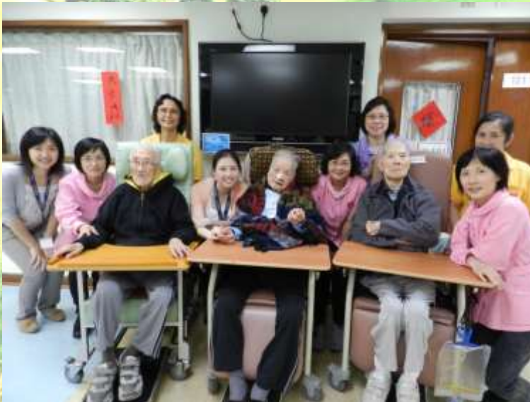
Interdisciplinary cooperation is essential in promoting residents' QoL under PC