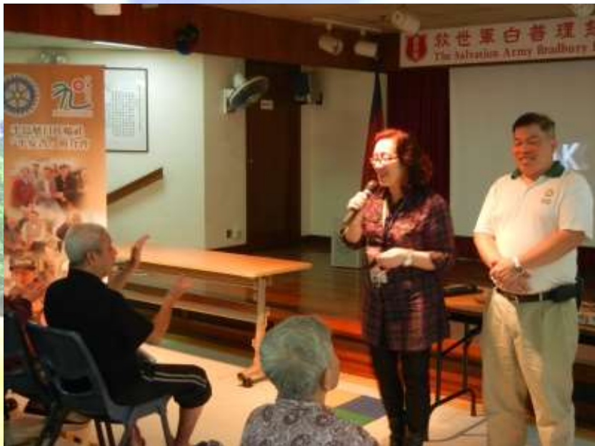
Legal Talk of Preparing Will